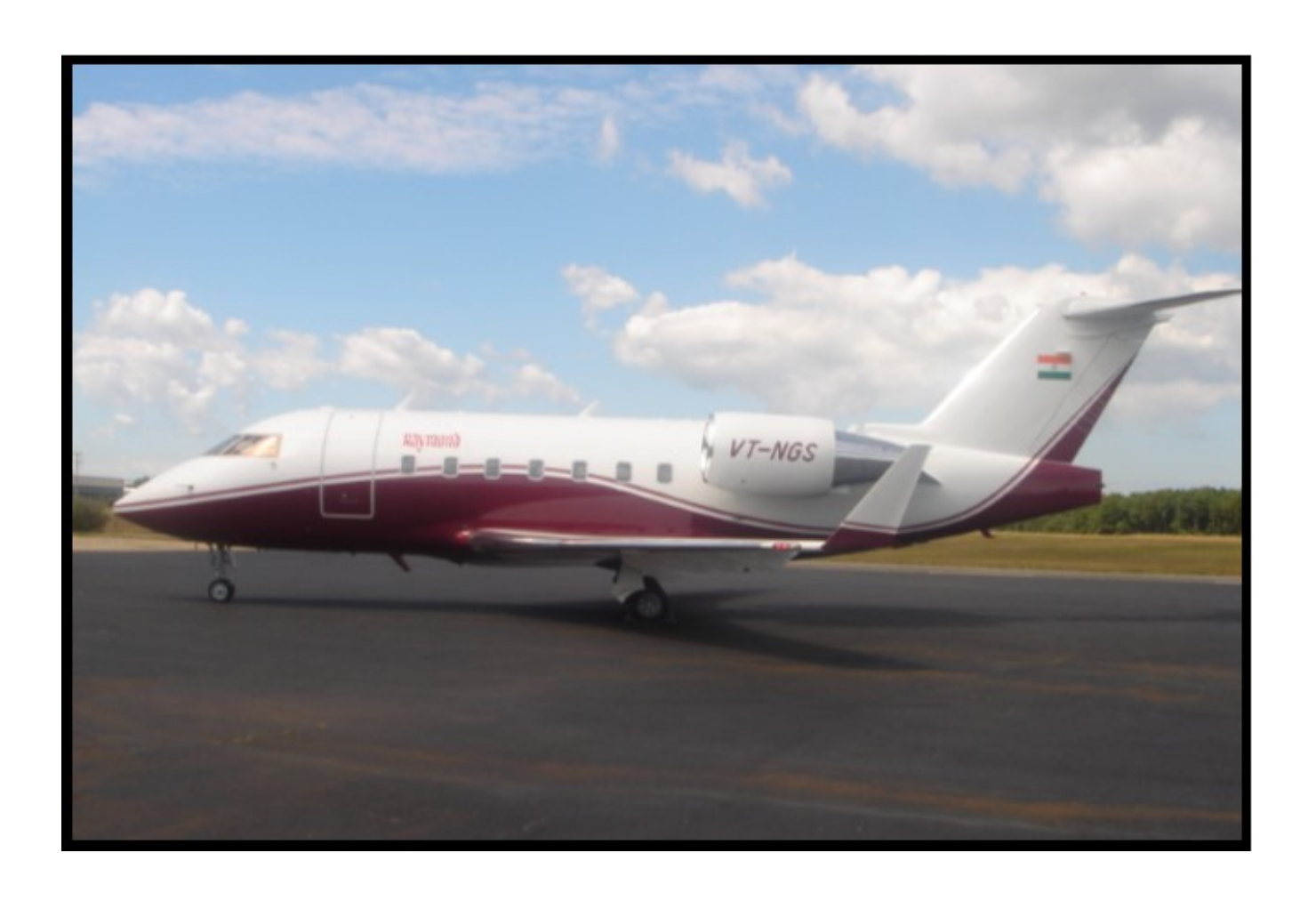
1996 Challenger 604 Sn-5314